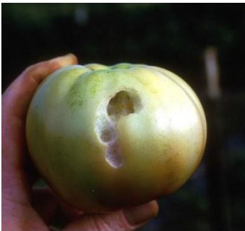
Hornworm damage on tomato

Hornworm damage usually begins to occur in midsummer and continues throughout the remainder of the growing season. The size of these garden pests allows them to quickly defoliate tomatoes, potatoes, eggplants, and peppers. Occasionally, they may also feed on green fruit. Gardeners are likely to spot the large areas of damage at the top of a plant before they see the culprit.